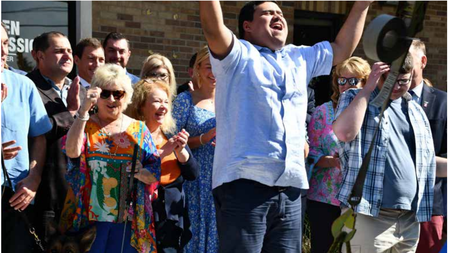
Students, staff, and SBJC friends celebrate the ribbon cutting of our new Ed Center at our October 5 Dedication Ceremony.

The mission of the South Bergen Jointure Commission is to unlock the potential of every student. As a leading educational provider, we will focus on the development of each student's social, emotional, and academic needs. By fostering an environment that is supportive and challenging, we will empower students to maximize their independence and potential in becoming fulfilled and productive members of their community.